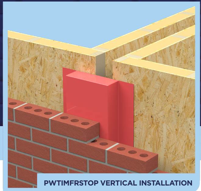
PWTIMFRSTOP VERTICAL INSTALLATION