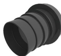
Multi Adapter RTV-ADMULTI