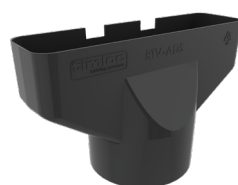
Standard Adapter RTV-ADS