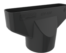
Plain Adapter RTV-ADP