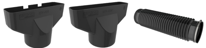
Standard Adapter RTV-ADS