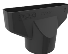
Plain Adapter RTV-ADP