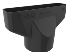
Plain Adapter RTV-ADP