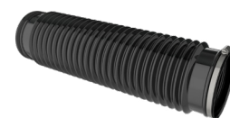
110mm Flexipipe RTV-KIT1