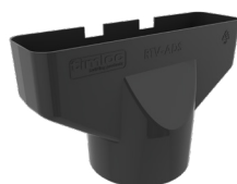
Standard Adapter RTV-ADS