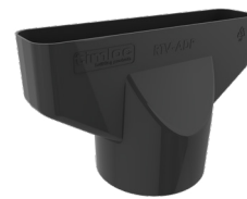
Plain Adapter RTV-ADP