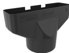
Standard Adapter RTV-ADS