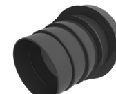
Multi Adapter RTV-ADMULTI