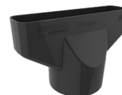
Plain Adapter RTV-ADP