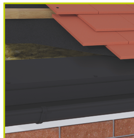
3017 & 1128