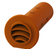
DV3 | Terracotta