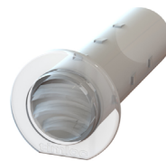
DV1 | Clear