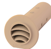
DV2 | Buff